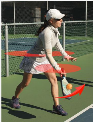
Figure 4-3 (legal serve)