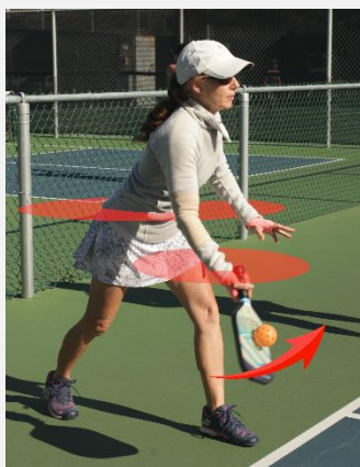
Figure 4-3 (legal serve)

(Photos and graphics courtesy of Steve Taylor, Digital Spatula)