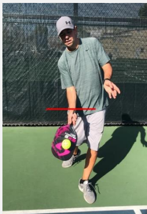
Figure 4-1 (legal serve)