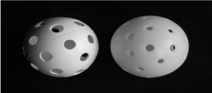
Figure 2-2. The Ball.

The ball pictured on the left of Figure 2-2 is customarily used for indoor play and the ball pictured on the right is customarily used for outdoor play. However, all approved balls are acceptable for indoor or outdoor play. The complete list of approved balls is on the IFP website.